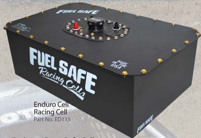
Enduro Cell Racing Cell Part No. ED115